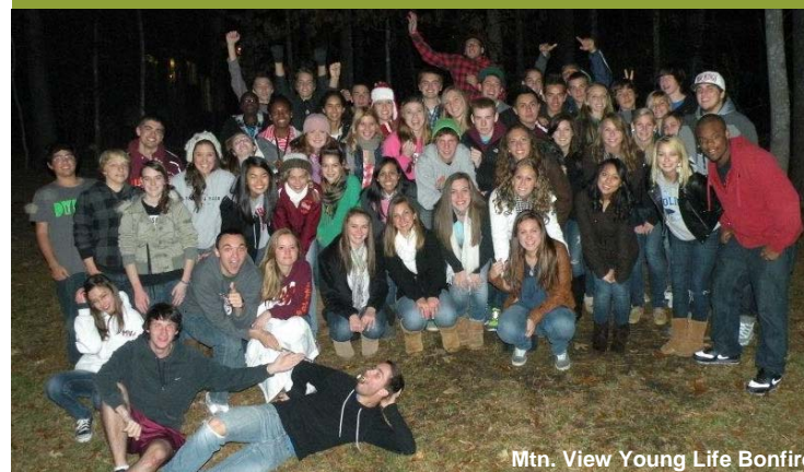
Mtn. View Young Life Bonfire